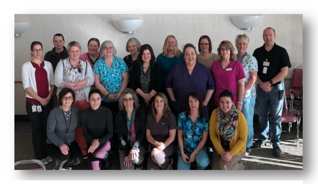
Thank you to our dedicated staff for your contribution to Strategic Plan 2020-23

For more on our Strategic Plan visit our website at <a href="ndmh.ca">ndmh.ca</a>